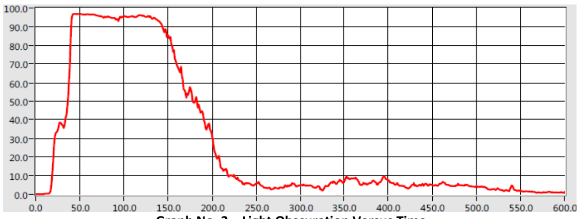
Graph No. 2 – Light Obscuration Versus Time