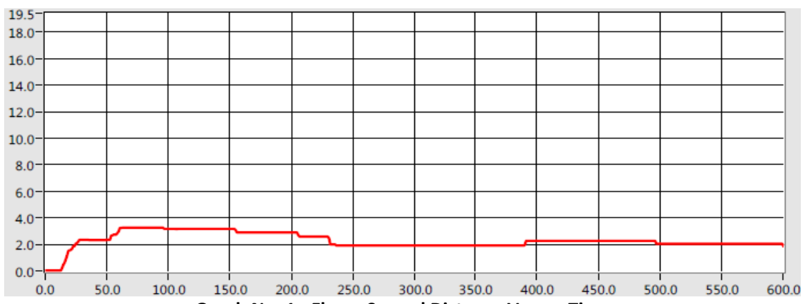
Graph No. 1 - Flame Spread Distance Versus Time