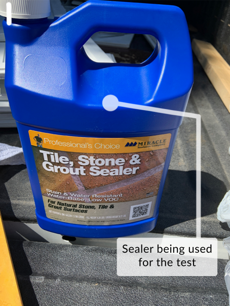
1 Sealer being used for the test