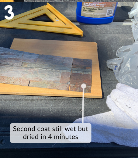
3 Second coat still wet but dried in 4 minutes